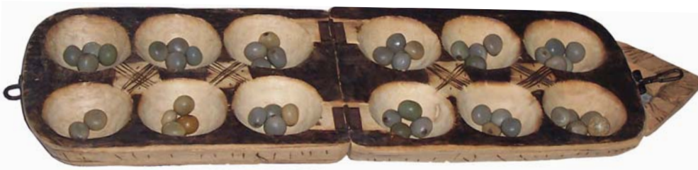
MANKALA. This game is played with pebbles, beads or large seeds on playing areas scooped out in sand, carved into solid rock, or on boards with two to four rows of holes, such as this one collected in Togo in 1965.