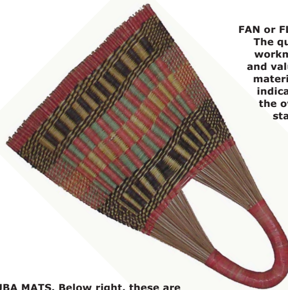
FAN or FLY WHISK. The quality of workmanship and value of the material were indicators of the owner's status.