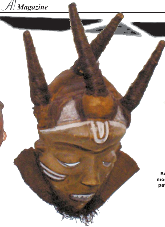
PENDE MASKS. These vary from a more abstract, geometric style typically found in the east to a more naturalistic one in the central area and to the west. Left, this mask has a long beard and topknot. The mask above is made of wood and fiber with white, black and red pigment dyes.